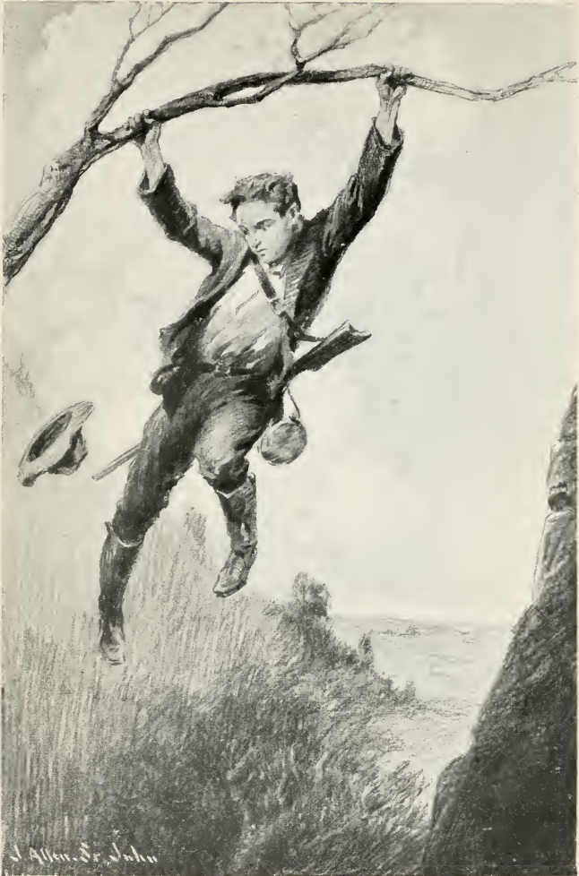
The branch cracked, then snapped under Jim's weight